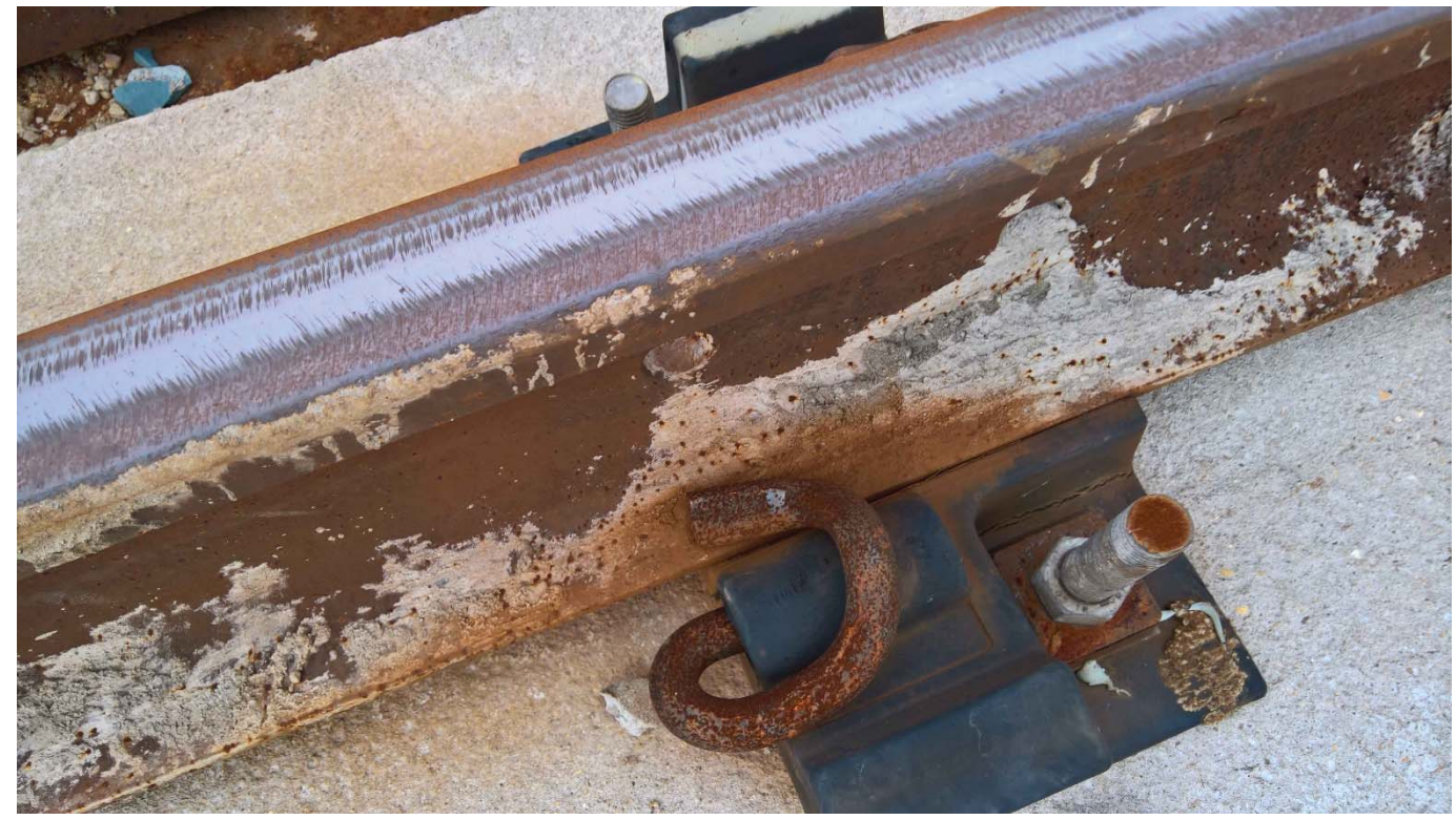
Figure 2: Fastener showing signs of degradation at D2 468+00