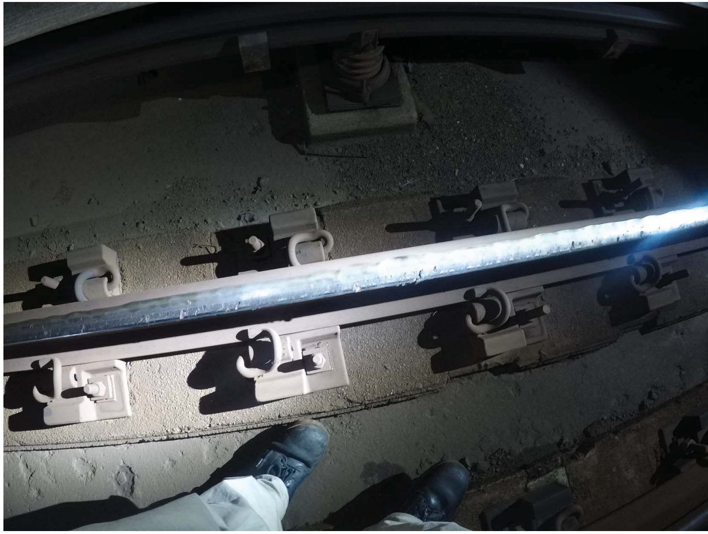
Figure 1: Spalling condition on the right rail at D1 283+50.