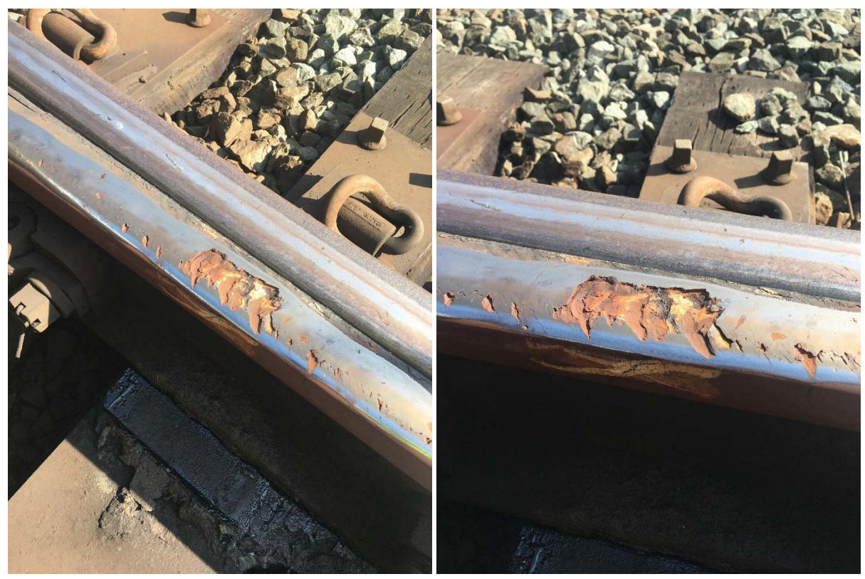
Figures 3 and 4: Spalling and rail head crack on the straight closure rail of the 11A switch at B2 116+20.