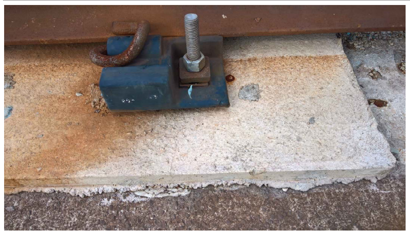
Figure 3: Fastener showing signs of degradation at D2 555+00