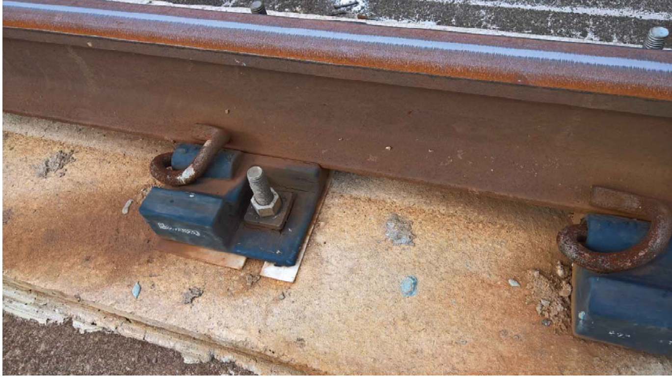
Figure 1: Fastener showing signs of degradation at D2 404+00