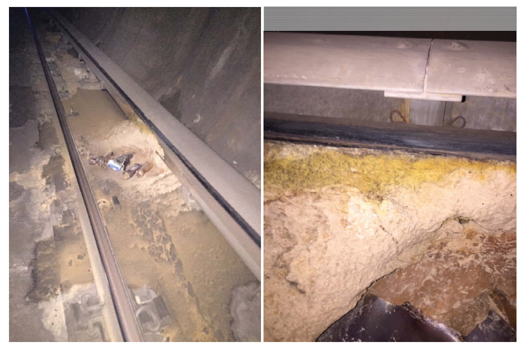
Figures 4 and 5: Mud/Silt contacting the third rail at G1 409+00, and showing signs of electric oxidation.