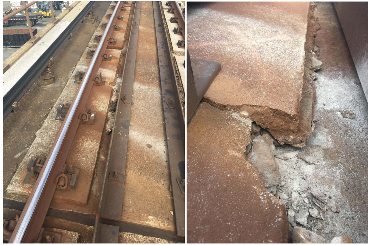
Figures 1 and 2: Defective fasteners and deteriorating grout pad between B2 144+00 and 145+00.