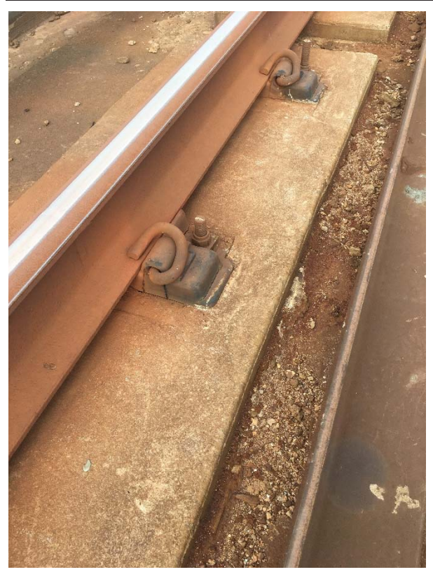
Figure 5: Deteriorating F-17 fasteners between B2 151+20 and 154+00.