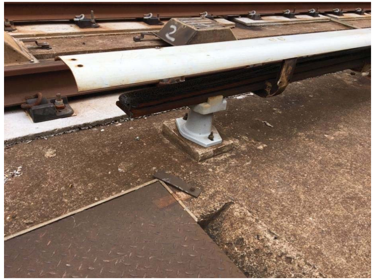
Figure 1: Third rail end approach arcing at C1 219+00.