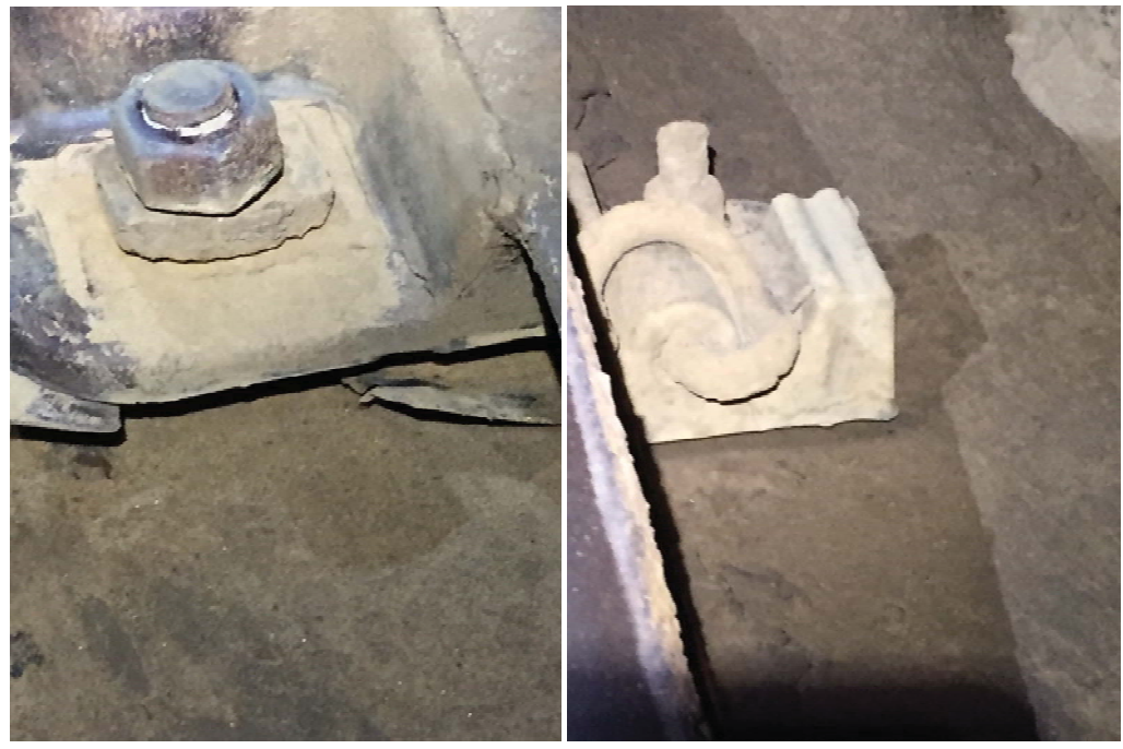
Figures 2 and 3: Sample of conditions between G1 408+10 and 408+20 elastic fastener and rail suspended from grout pad.