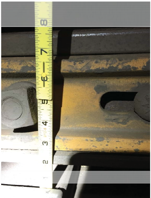
Figure 1: Rail joint at G1 409+30 suspended 1-7/8 inches from seat in elastic fasteners and not supported.