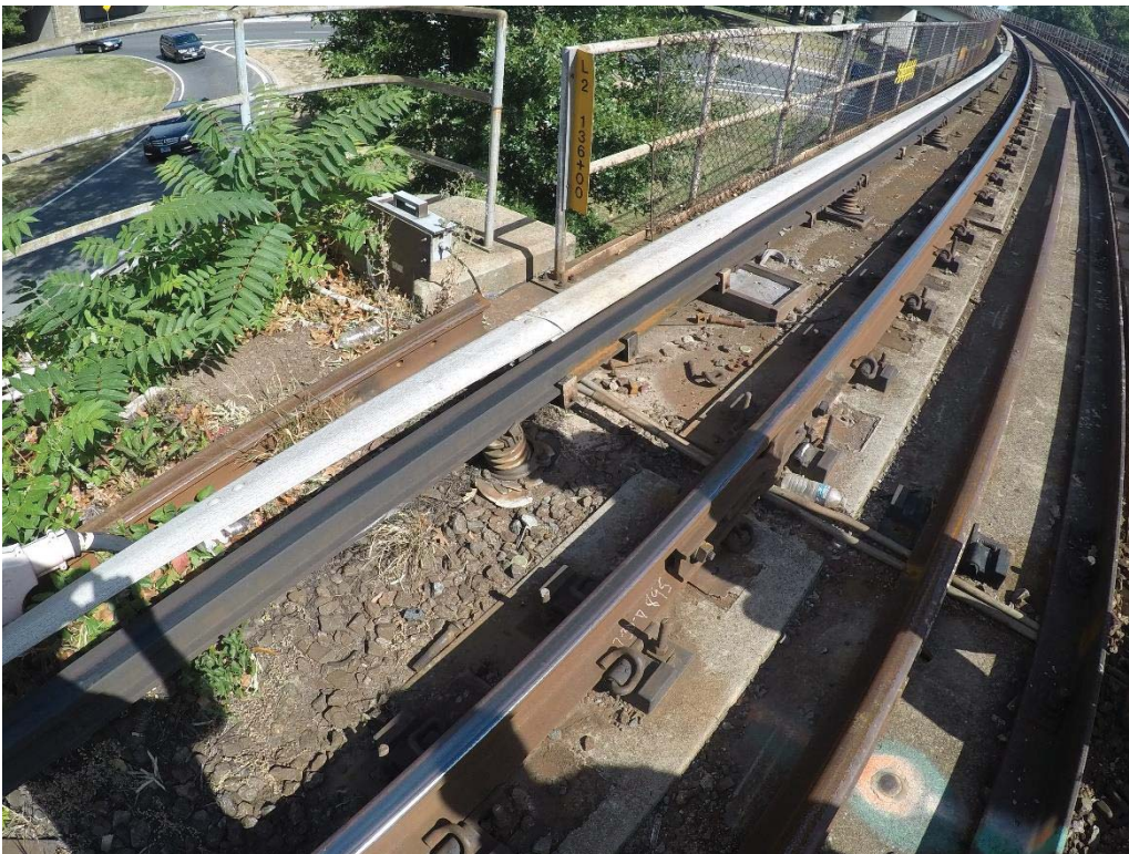
Figure 4: Damaged insulators at L2, 136+00.