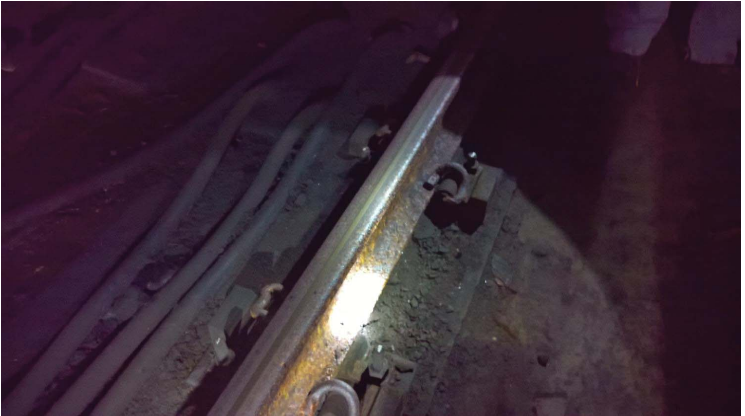
Photo 2: A1 157+00, left rail web and base corrosion from tunnel leak above.