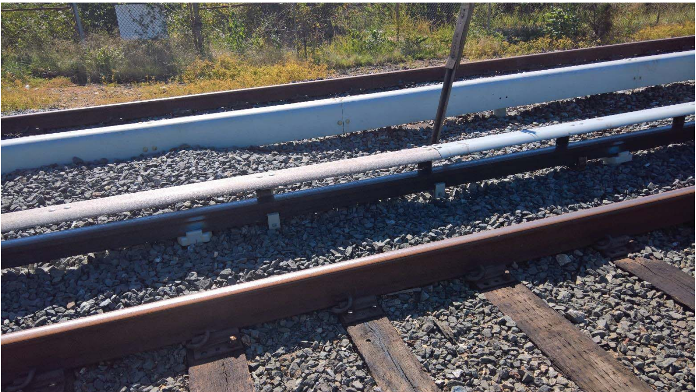
Figure 4: Ballast is up to and over the base of the third rail between D2 433+00 and D2 438+00.