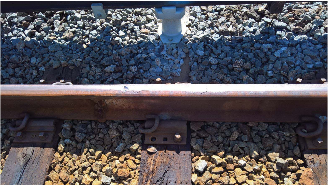
Figure 1: Shelling condition with chips of rail broken out at D2 416+40 on right rail.