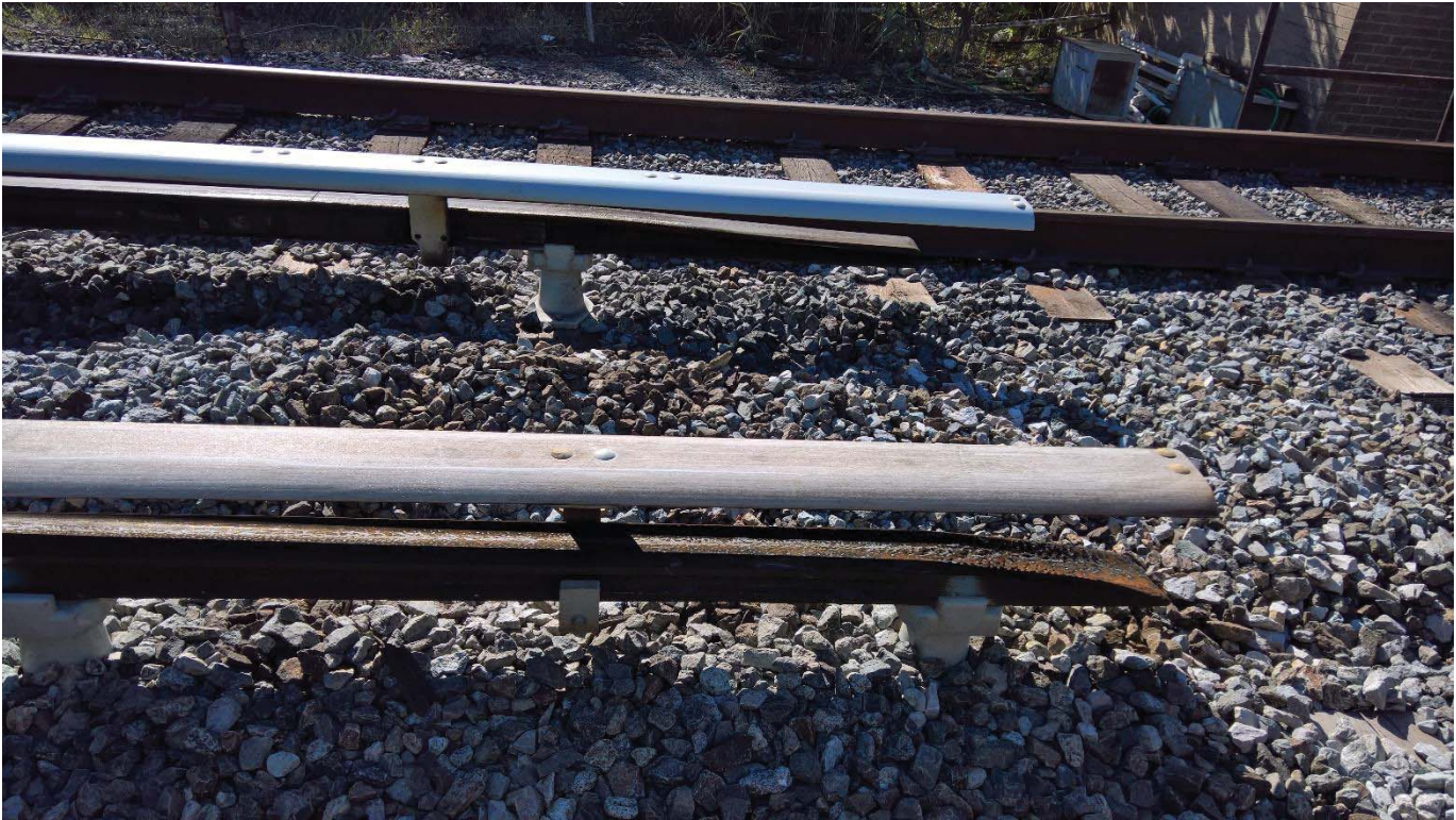
Figure 3: Over 50% of the end approach ramp worn away at D2 340+00.