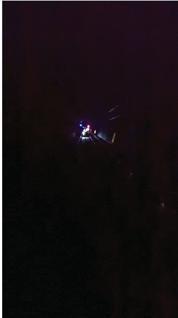
Figures 1 and 2: No working tunnel lights between B1 480+25 and working limits. The on-track equipment was providing the only lighting for workers.