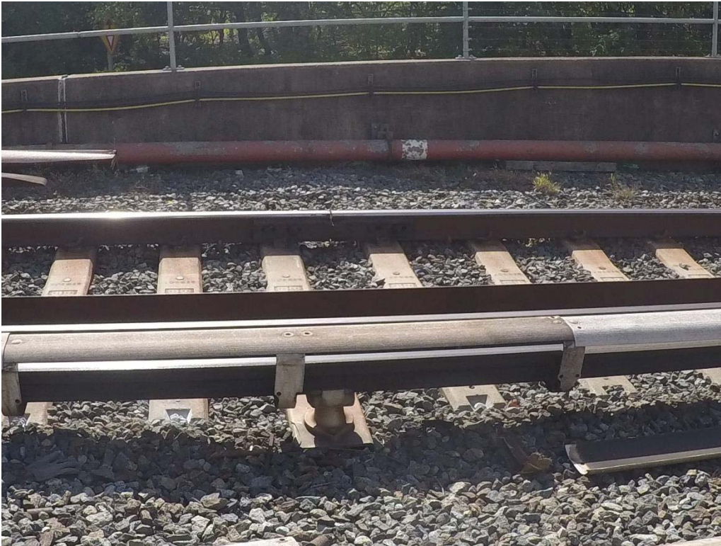
Figure 3: Incorrect joint bars installed on an open joint at L1 136+00.