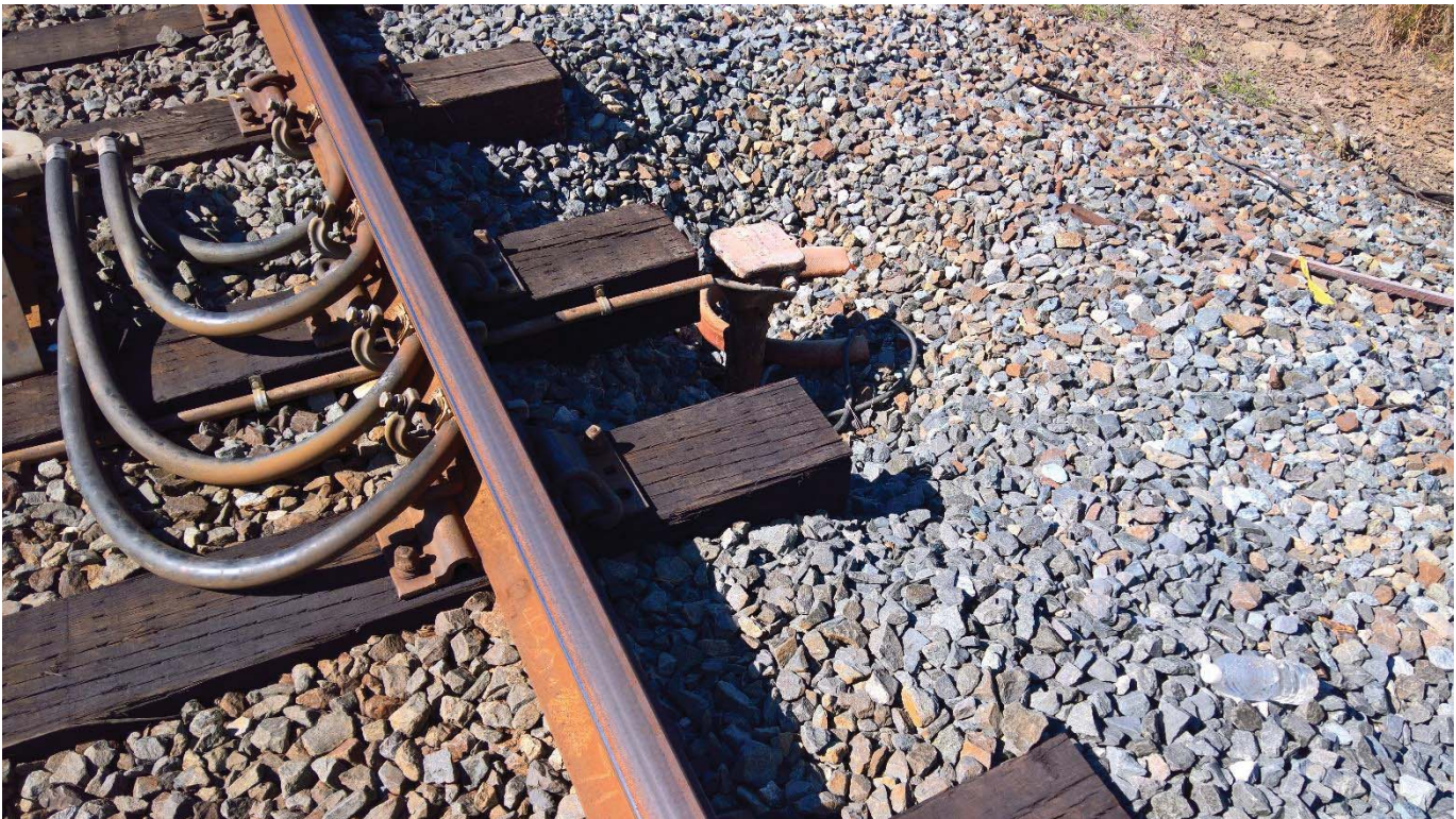
Figure 2: Ballast condition around a stub-up at D2 430+80.