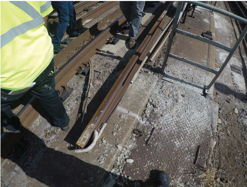
Figure 2: Piece of relay rail resting against a third rail heater cable in tension at L2 136+00.