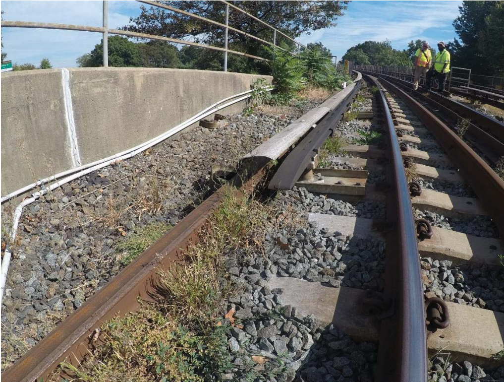
Figure 1: Third rail was canted and was not showing signs of normal wear. A piece of relay rail was within 4 inches of the third rail at L2 136+30.