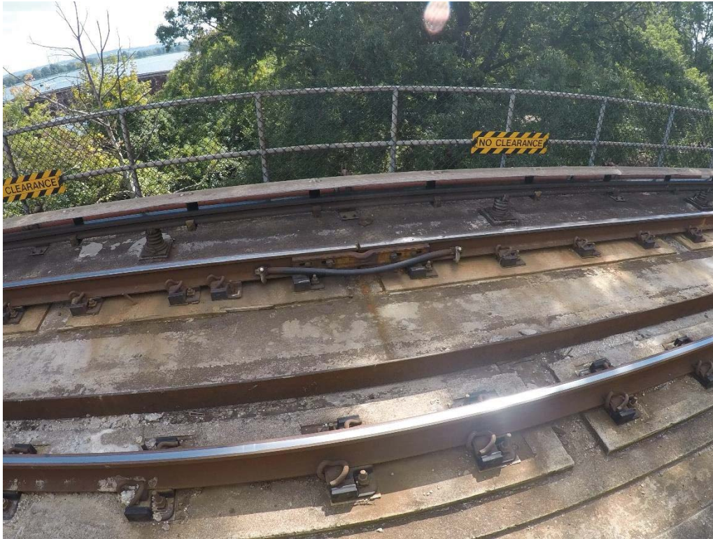
Figure 5: Incorrect joint bars installed on an open joint at L1 131+00.