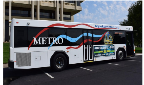
Topeka Metro bus.

Questions? Contact info@topekametro.org .