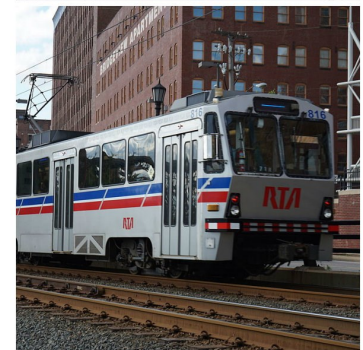
Ohio's SSO Agency oversees the safety of the Cincinnati Bell Connector Streetcar and Greater Cleveland Regional Transit Authority's Rapid Transit rail system.