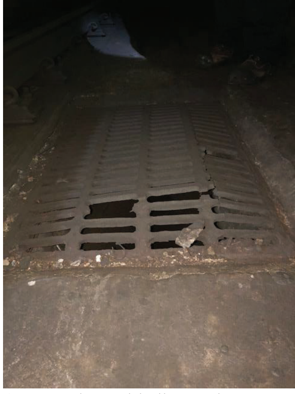
Figure 2: Center drain corroded and bent upwards at G1 449+30.