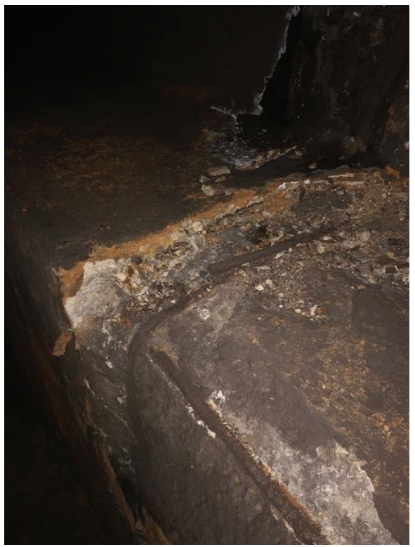
Figure 1: Catwalk at G1 431+70.