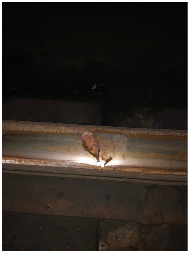
\textbf{Figure 1:} \ \, \text{At D1 0085+85, on the right rail a chipped condition was observed.}