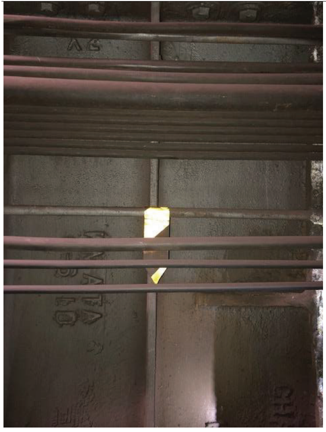
Figure 1: Between D04 and D05, all grab handles were behind wires and conduit.