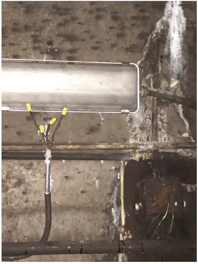
Figure 1: At A2 0358+10, exposed 110V wires.