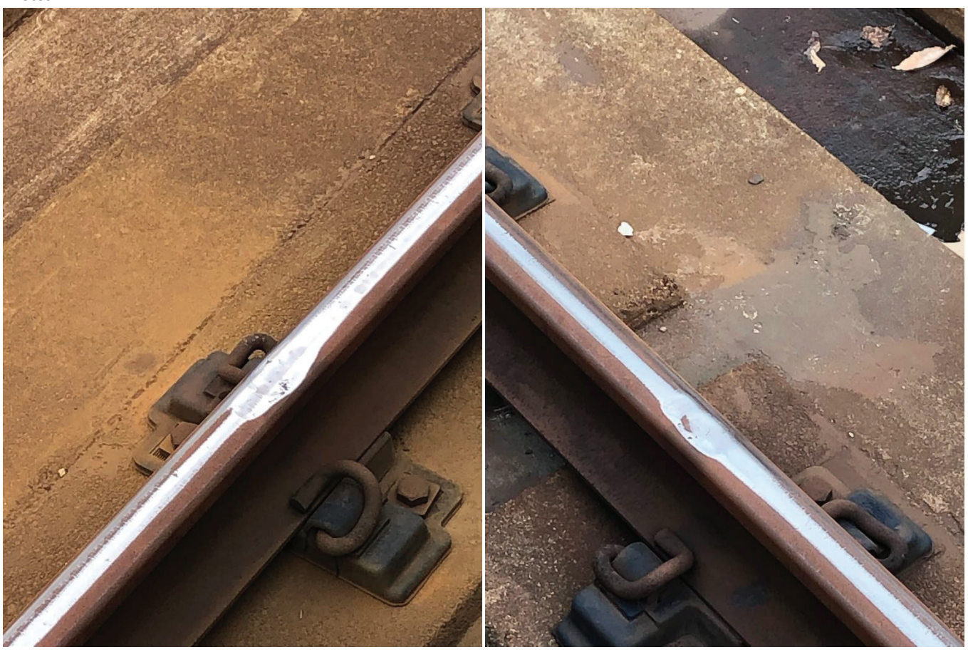
Figures 1 and 2: Engine burns near the 6-car marker on the right rail of track 2 at the West Hyattsville station.