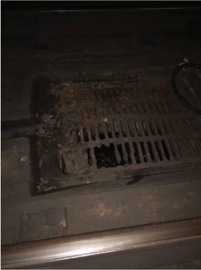
Figure 1: Corroded center drain at L2 152+50.