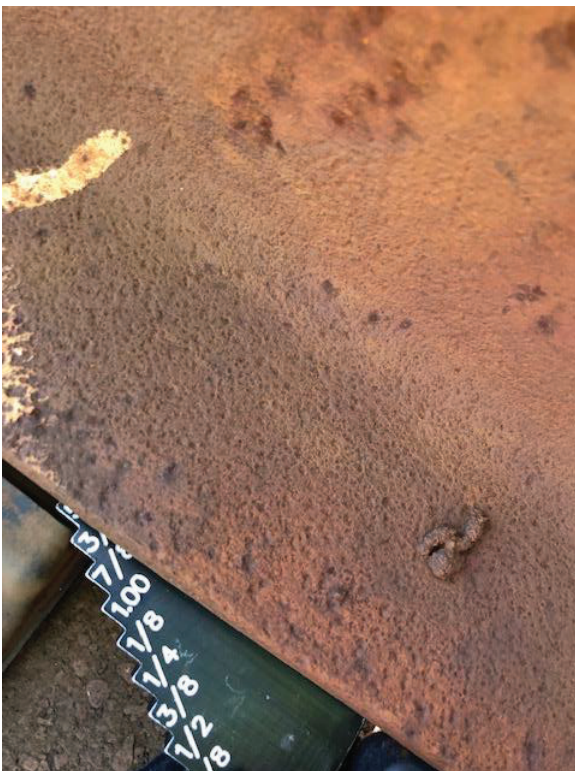
Figure 2: Between J2 616+25 and 616+36, a 5/8-inch gap between the base of the rail and the fastener plate. Step gauge used to obtain measurement.