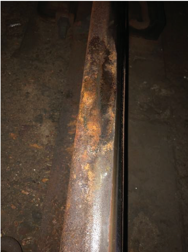
Figure 1: Corroded right rail at D2 087+90.