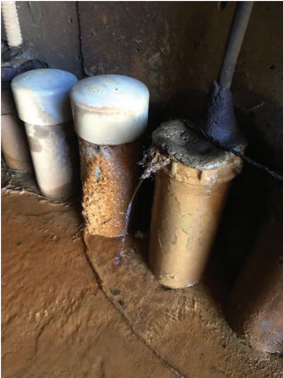
Figure 1: At F1 343+00, water extruding from conduit stub-up draining onto the track bed.