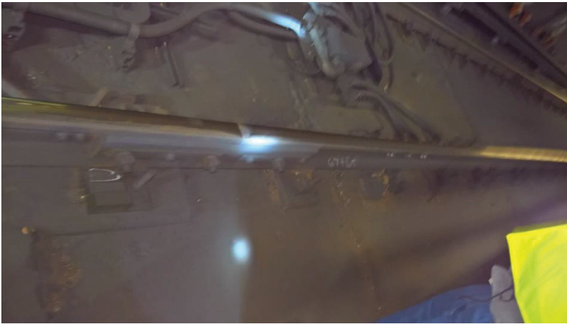
Figure 1: Defective fasteners at CM C1 067+65.