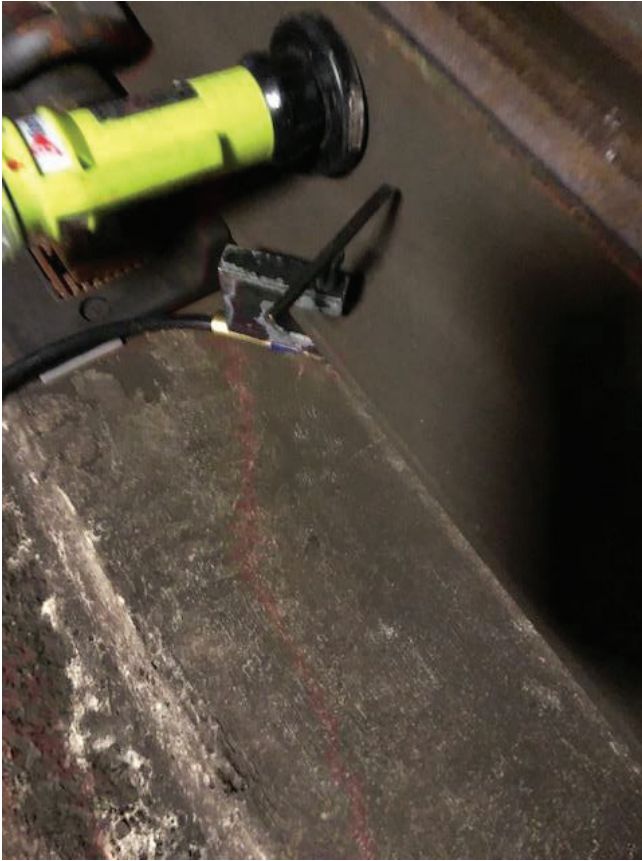
Figure 1: A1 007+00, old type non-locking shunt in use.