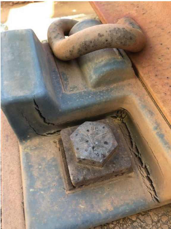
Figure 4: Between J2 668+00 and 658+00 on the aerial structure, failing fasteners were observed.