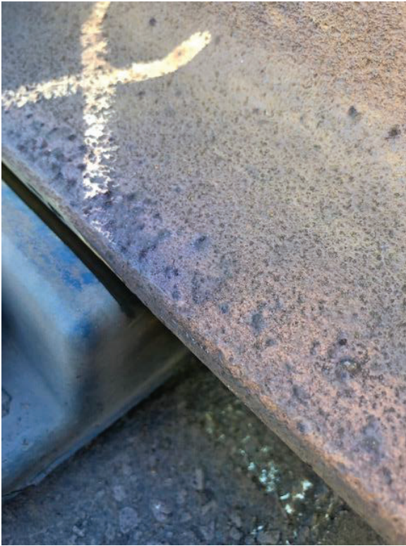
Figure 3: Between J2 616+25 and 616+36, a 5/8-inch gap between the base of the rail and the fastener plate. Step gauge used to obtain measurement.