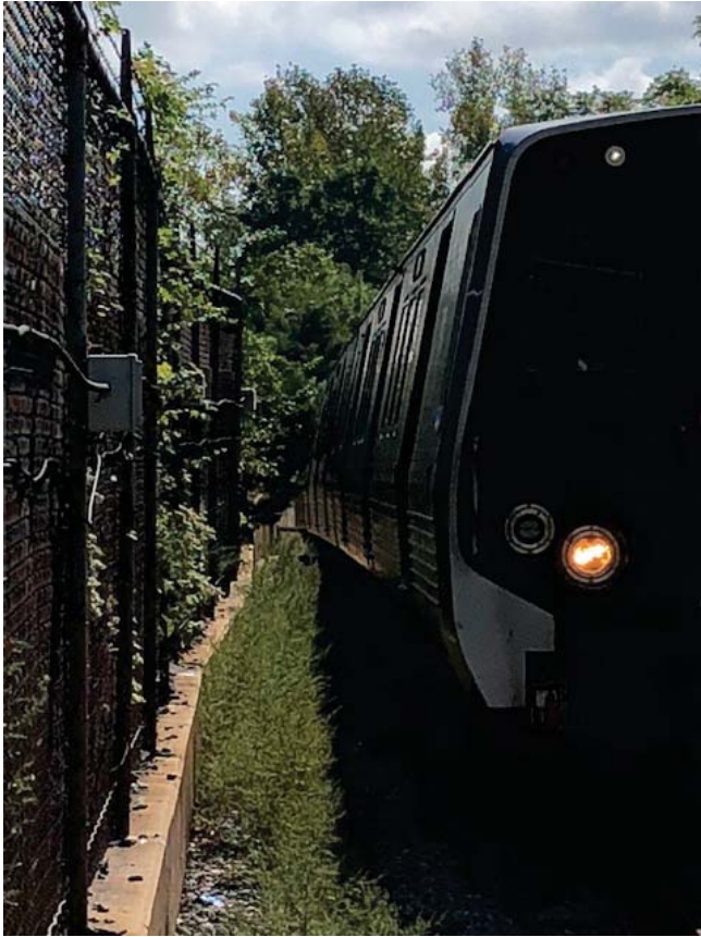
Photo 3: At A2 678+00, track-side vegetation contacting on-track vehicles.