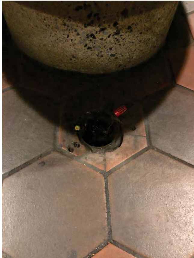
Figures 1: Exposed wires at the north end of L'Enfant Plaza under the customer waiting bench.