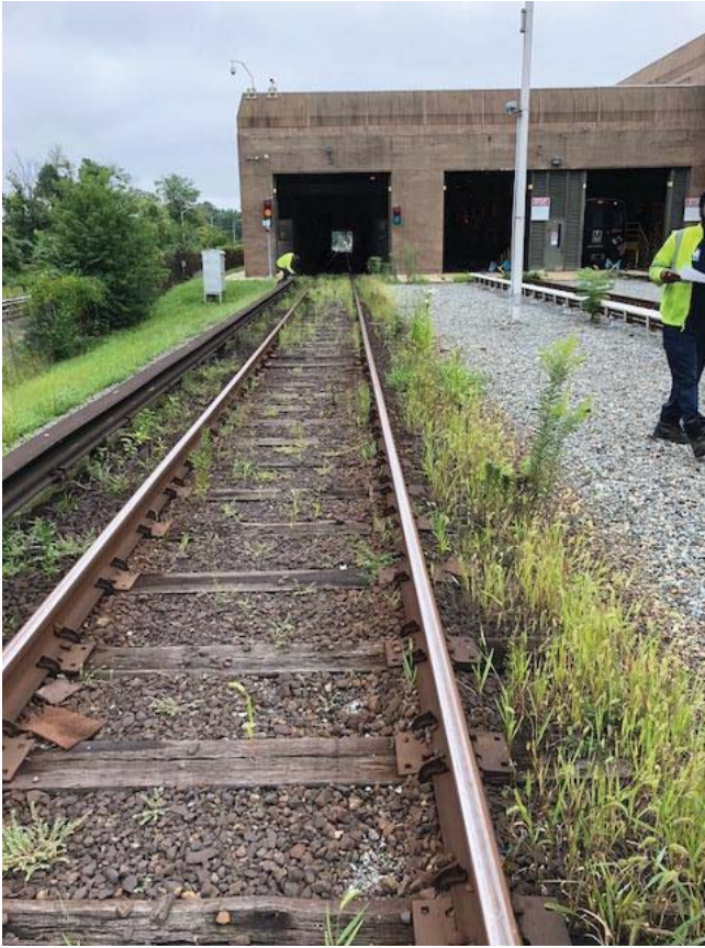
Figure 1: Overgrown vegetation at YRC 76.