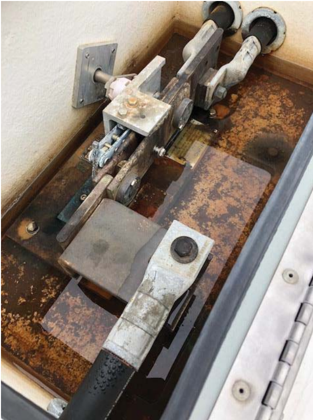
Figure 1: Disconnect box number 2 at YRC 45.