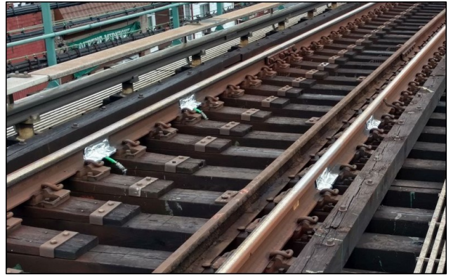
Lateral/vehicle measurement equipment installed on a track

and instrumented wheel sets. The data collection car was part of a larger vehicle consist being used in revenue service. The team also outfitted a NYCT track geometry car with data measurement equipment. Both cars were equipped with Radio Frequency Identification (RFID) readers that could position data maps produced by the track geometry car within feet of where data was obtained from the data collection car. This provided a way for the team to overlay the track map on the data collection car's data map to quickly identify potential issues or abnormalities with vehicle and track performance. Meanwhile, truck bogie optical geometry inspection and lateral/vehicle measurement gear was used to collect data from the track and wayside.