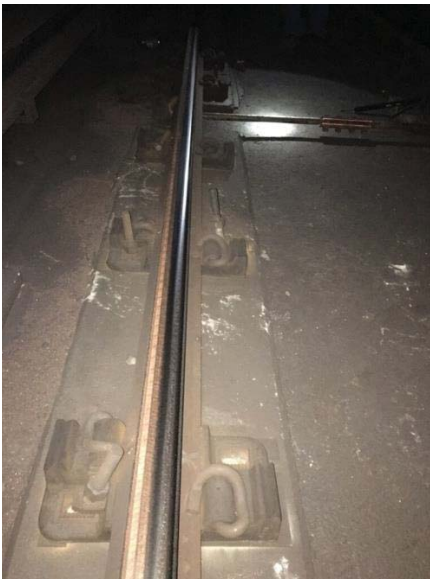
Figure 2: Gauge rod installed at L1 158+85.