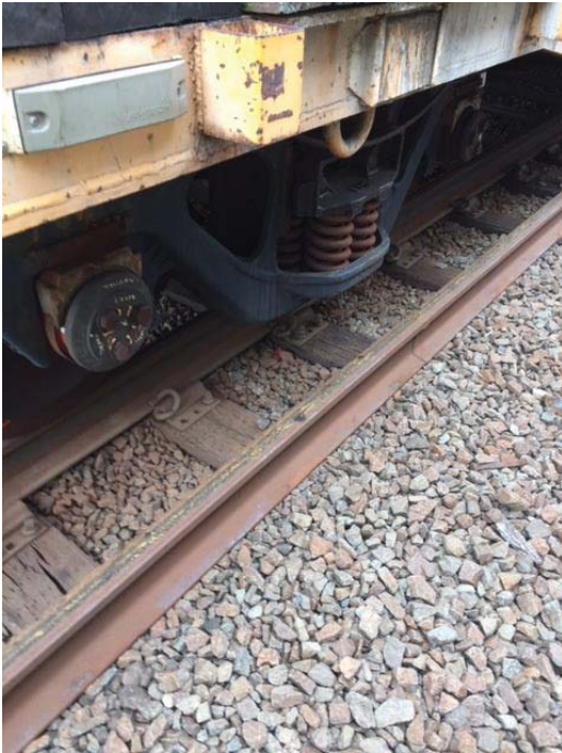
Figure 1: WMATA flatcar F525 without wheels chocked. Chocks were readily accessible but not used.