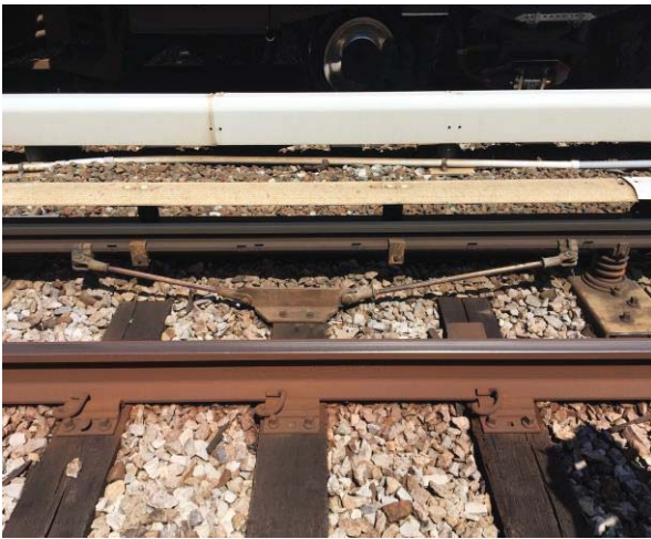
Figure 2: Anchor arm repaired at D1 239+50.