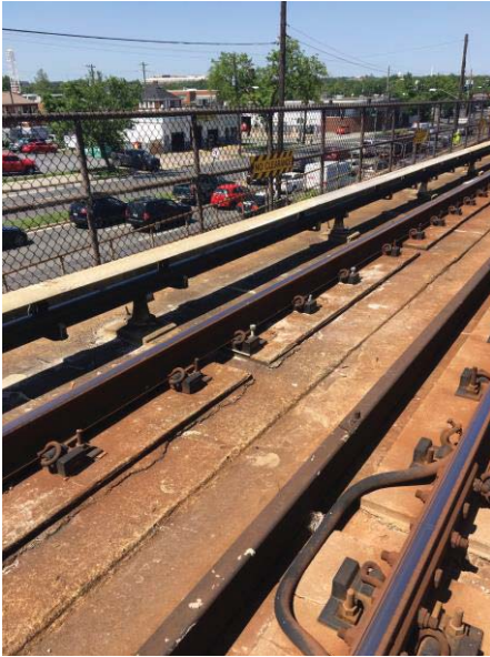
Figure 1: Fasteners replaced at D1 287+50.