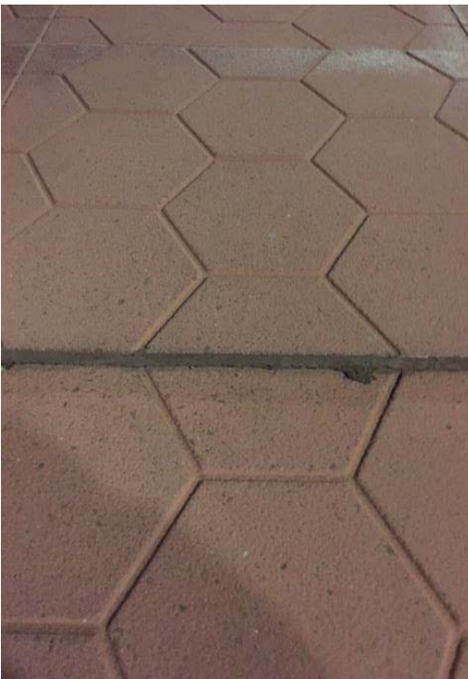
Figure 2: White Flint platform adjacent to A1 640+80 (Glenmont side), heaved paver presenting a potential trip-and-fall hazard.