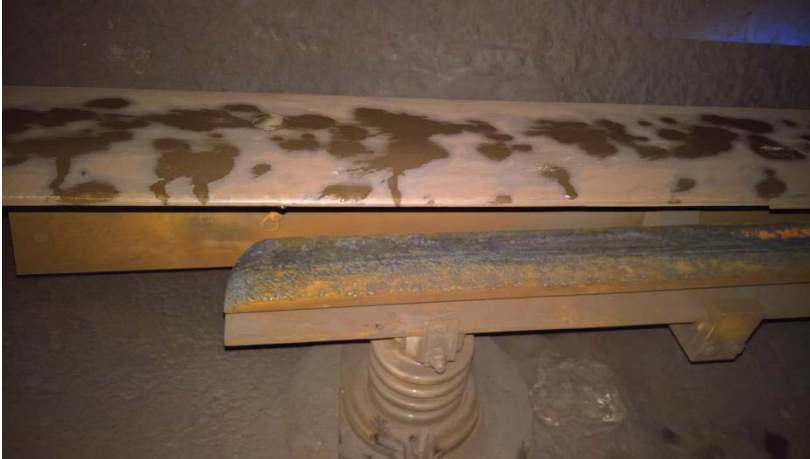
Figure 1: Third rail end approach at CM B1 607+30.