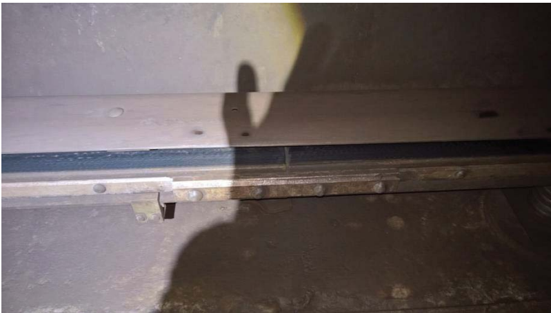
Figure 2: Damaged joint bar between CM B1 608+00 and CM B1 609+05.