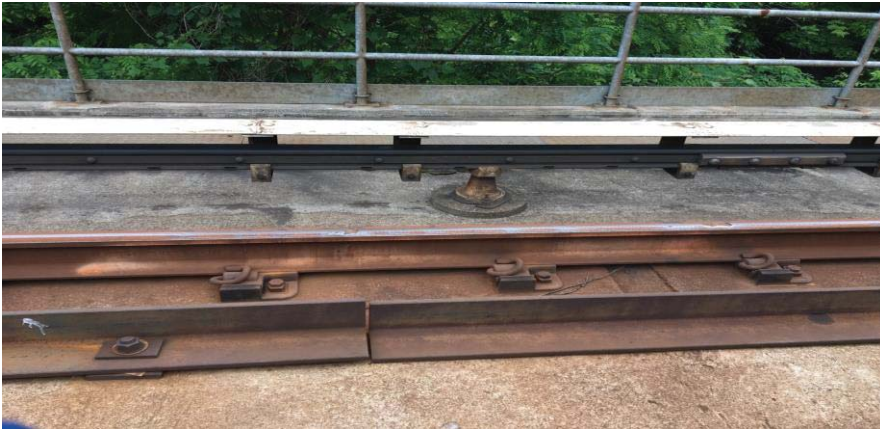
Figure 1: Engine Burn Defect at F1 322+70.