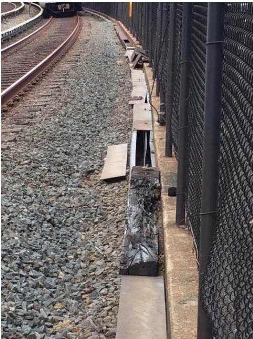
Figure 4: Between K1 348+00 and K1 368+00, missing. Loose and dislodged electrical trough covers, located on the right fence side, which is the designated place of safety.