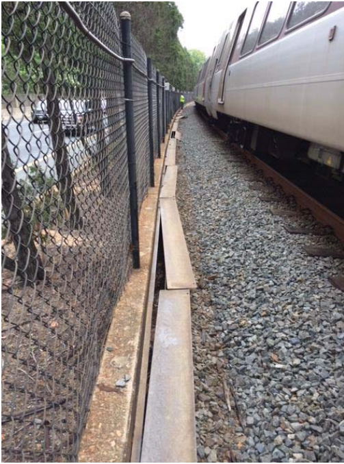
Figure 3: Between K1 348+00 and K1 368+00, missing, loose and dislodged electrical trough covers, located on the right fence side, which is the designated place of safety.