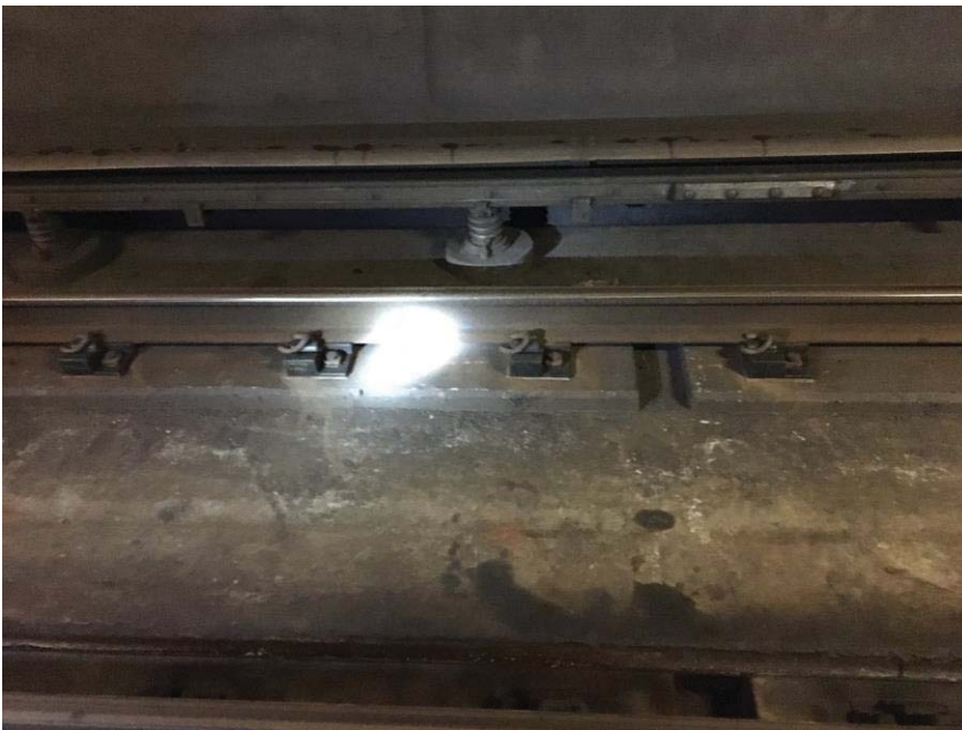
Figure 2: Repaired fasteners at F1 338+40.