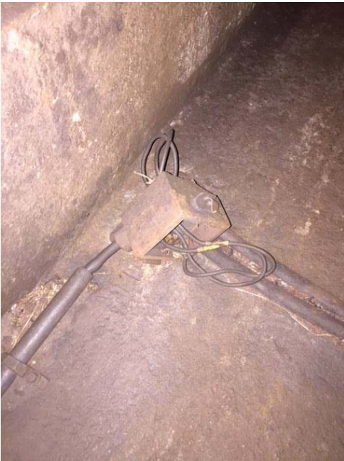
Figure 2: K1 288+10, electrical junction box with exposed wires lying between the tunnel walkway and catwalk.