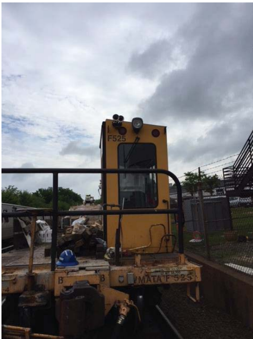
Figure 2: WMATA flatcar F525 without wheels chocked. Chocks were readily accessible but not used.