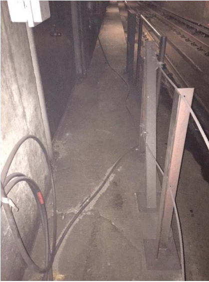
Figure 1: Inbound track entrance, Union Station B2 066+00, loose unsecure and dangeling wires were observed.