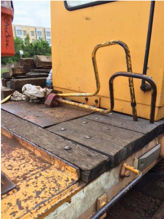
Figure 3: Unused wheel chocks.