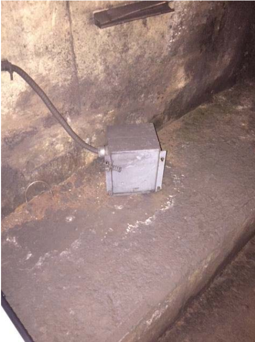
Figure 1: K1 285+00, electrical junction box dislodged from the wall, lying on the tunnel catwalk.