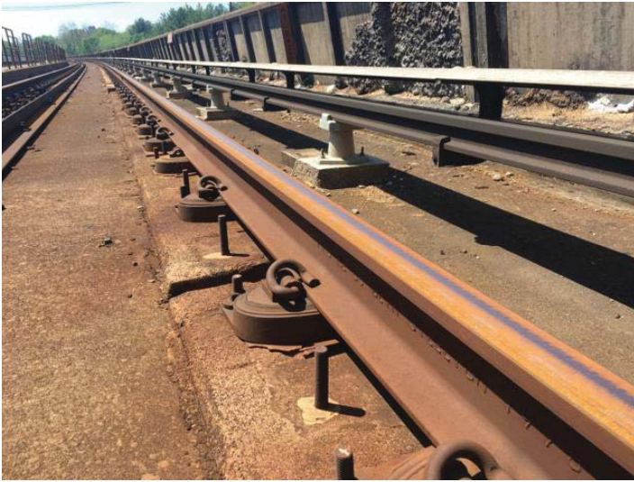
Figure 1: Condition of the fasteners during reinspection showed no signs of vertical movement or gauge issues at A1 541+00.