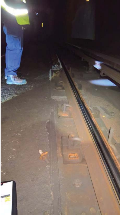
Figure 1: Defective fasteners at CM L1 158+90 to CM L1 158+80.