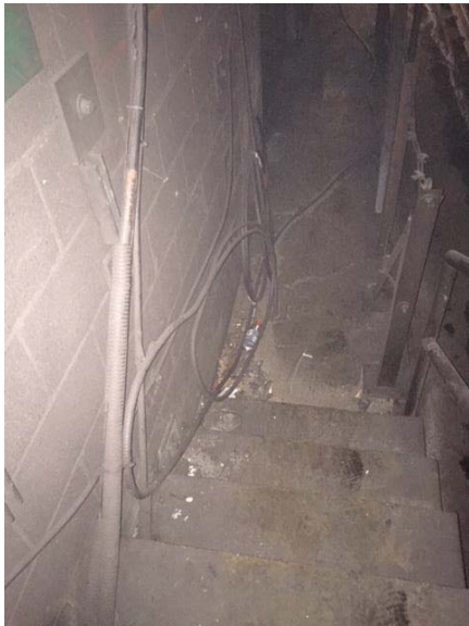
Figure 2: Inbound track entrance, Union Station B2 066+00, loose unsecure and dangeling wires were observed.