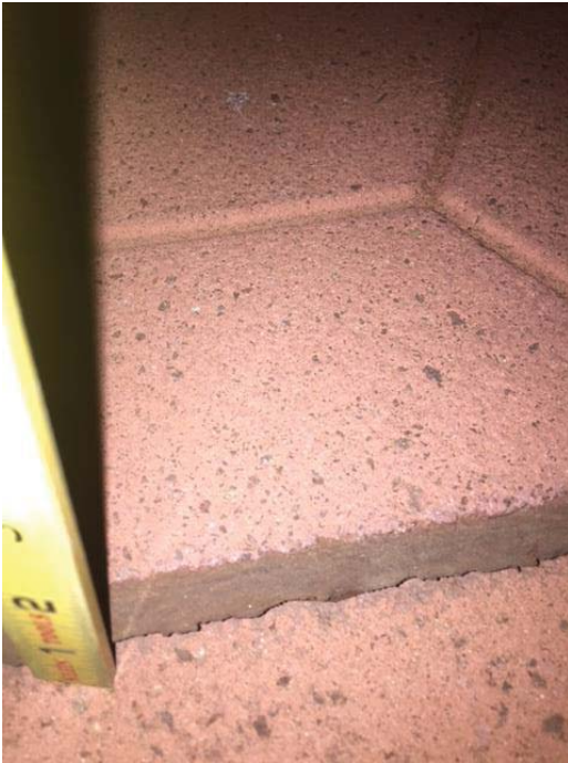
Figure 1: White Flint platform adjacent to A1 640+80 (Glenmont side), heaved paver presenting a potential trip-and-fall hazard.