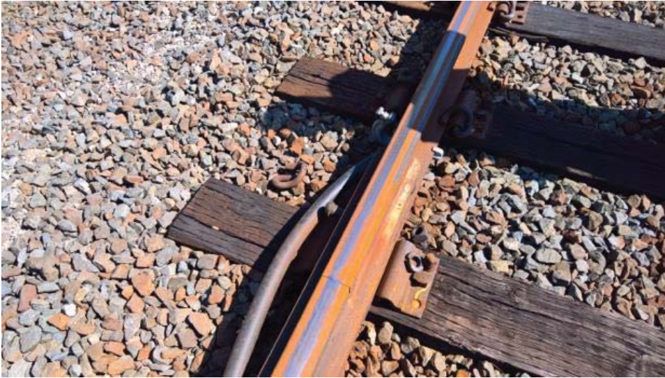
Figure 1: Joint bar with bolt out at CM J 2 856+00.