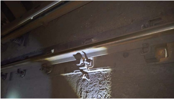
Figure 1: Defective fasteners at CM F2 59+60 to CM F2 59+40.