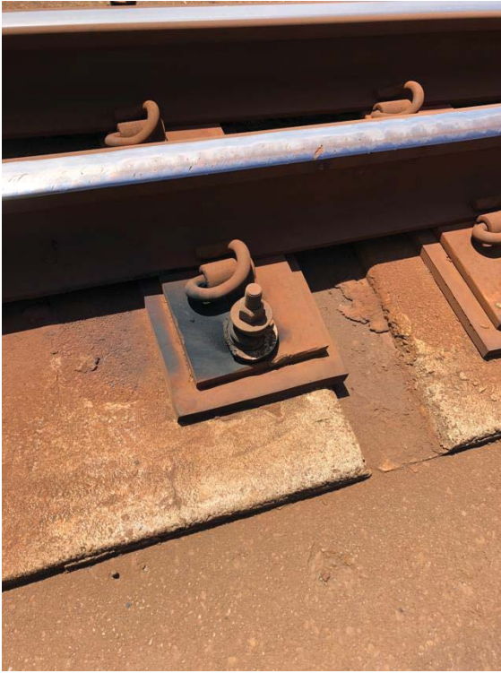
Figure 1: Arcing stud bolt at D1 283+10.