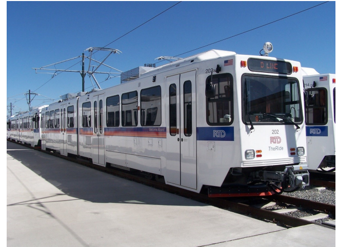
Colorado's SSO Program, which obtained FTA certification on April 6, oversees the safety of the Regional Transportation District rail system