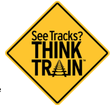
The logo for OLI's "See Tracks? Think Train!" campaign

As part of OLI's national See Tracks? Think Train! Campaign, transit agencies can download posters, graphics, videos, and radio ads, or purchase key chains or other giveaways with the campaign's yellow diamond logo. In addition, many examples of creative safety posters, videos, fact sheets, and other materials created by transit agencies with grants from OLI are also available on the website.