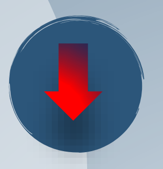
Accident Rates and Workers Compensation