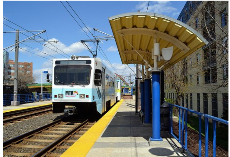
An MTA light rail train at the University of Baltimore Station in Maryland.