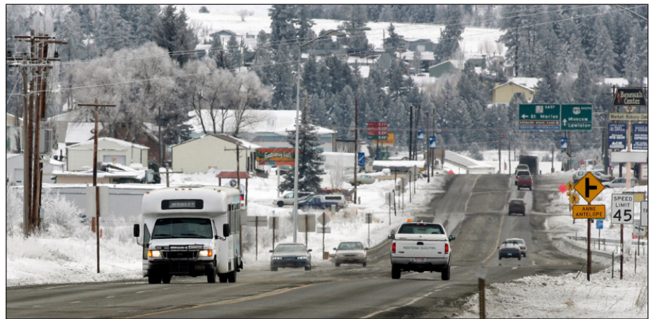
Rural transits systems face unique challenges in maintaining a compliant random testing program.

Since the goal of the random program is both detection and deterrence of drug use and alcohol misuse, each employee should have a reasonable expectation that they may be selected for random testing anytime they are performing safety-sensitive duties. Randomizing (or strategically altering) your random testing rate each selection period may be an effective way of drastically improving your random testing program. ●