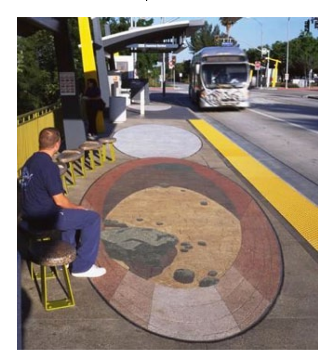
Terrazzo pavement design at Woodley Station