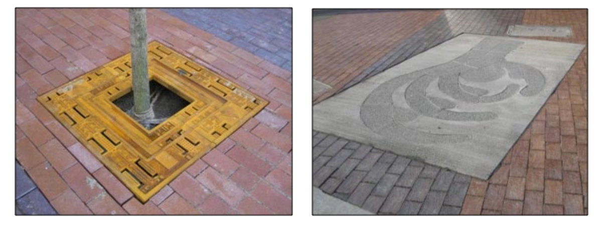
Figure 4-8 Cast iron decorative tree grate and rendered granite sidewalk art

In homage to the region's cultural history, 11 variants of the Hopewell sign language, used during trade by the ancient Hopewell mound cultures of the Great Lakes Region, were fashioned out of rendered granite pavers and set into the sidewalk at various sites along the HealthLine corridor. Imagery reflecting Cleveland's cultural and industrial heritage was incorporated into the design of standard items such as crosswalks, benches, litter receptacles, lighting elements, and tree grates, which also serve as integrated art pieces throughout the entire corridor.