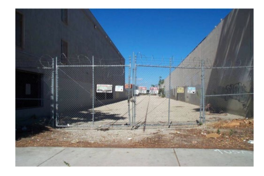
Figure 2-19 Commercial area

Commercial area before Orange Line construction