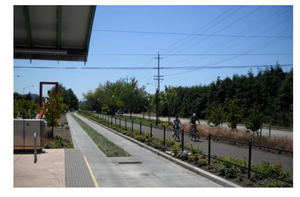
Figure 3-16 Multi-use path

LTD worked with the City of Eugene and the Bicycle/Pedestrian Advisory Committee (BPAC) to consider pedestrian and bicycle enhancements that could be incorporated into the design of the EmX project. To improve conditions for walking and biking in neighboring areas, bike lanes and sidewalks were constructed along sections of the Franklin Corridor where they did not previously exist. The Gateway Extension project was also designed to preserve and enhance bicycle and pedestrian amenities. For instance, the popular multi-use Rosa Parks Path in the Pioneer Parkway median was preserved, while the former 5-foot sidewalks on International Way (along the loop of the Gateway Extension) were widened to create 10-foot multi-use paths on both sides of the street. To encourage bicycle travel and multi-modalism, bicycle storage is provided on EmX vehicles and at stations.