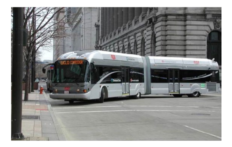
Figure 4-17 HealthLine's highcapacity rapid transit vehicle (RTV)

In a commitment to replenish the urban forest, the City added nearly 1,500 new street trees to the corridor landscape. The trees were planted in soil designed specifically for Cleveland's severe winters and harsh urban environment, and are irrigated from water lines installed during the street's renovation. In the downtown district, soil trenches running beneath the sidewalks provide the amount of soil necessary for maximum root growth, while in many areas trees are placed in raised planters to protect them from the sidewalk salt of the winter street. Twenty-six different species were planted along the corridor, with several varieties mixed in each district to avoid creating a monoculture.