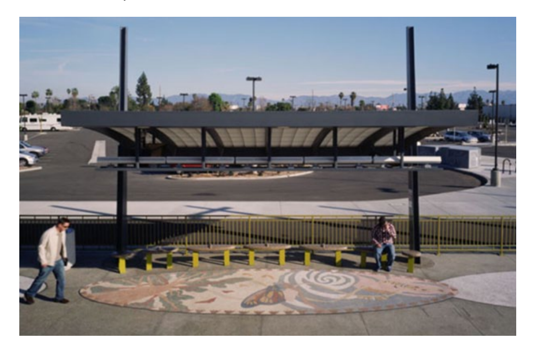
Figure 2-5 Terrazzo pavement design at Sepulveda Station

The pavings and art panels at Sepulveda Station were designed as a tribute to the Sepulveda Wildlife Reserve and the efforts of people who strive to protect natural habitats. A map of the west coast of North America and the monarch caterpillar on a double spiral are a reference to the migratory path of the monarch butterfly from Canada to central Mexico.