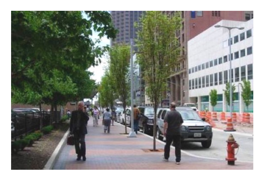
Figure 4-13 Median tree plantings

Newly-planted trees on downtown sidewalks