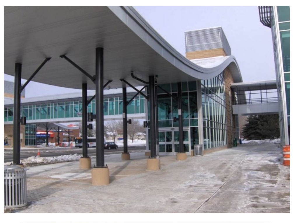
Figure D-6 Züm BRT Station,

Apple Valley BRT Station, serving Cedar Avenue Transitway, Apple Valley, MN