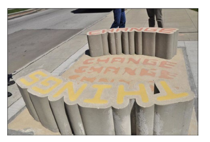
Figure 4-7 Functional artwork seating

In homage to the region's cultural history, 11 variants of the Hopewell sign language, used during trade by the ancient Hopewell mound cultures of the Great Lakes Region, were fashioned out of rendered granite pavers and set into the sidewalk at various sites along the HealthLine corridor. Imagery reflecting Cleveland's cultural and industrial heritage was incorporated into the design of standard items such as crosswalks, benches, litter receptacles, lighting elements, and tree grates, which also serve as integrated art pieces throughout the entire corridor.