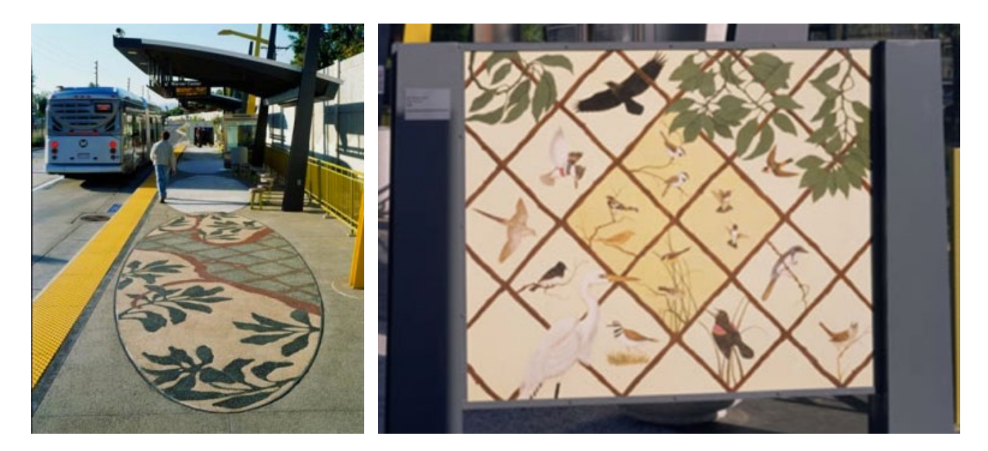
Figure 2-4 Terrazzo paving (left) and art panel (right) at Pierce College Station