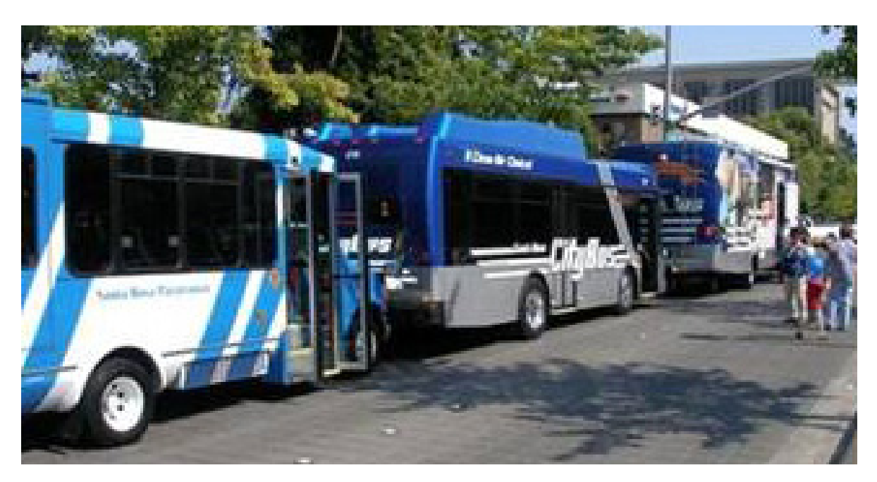
Santa Rosa, CA, received $5 million in American Recovery and Reinvestment Act of 2009 funds for paratransit services, solar bus shelters, and two hybrid buses.

Advanced Small Transit Vehicle Program. As part of FTA's advanced small transit vehicle (ASTV) demonstration program, West Virginia University (WVU) provides program coordination and management support for multiple demonstration projects. In FY 2009, WVU developed data collection methods for the ASTV demonstration sites. The methods are tailored to the individual vehicles and technologies being demonstrated.