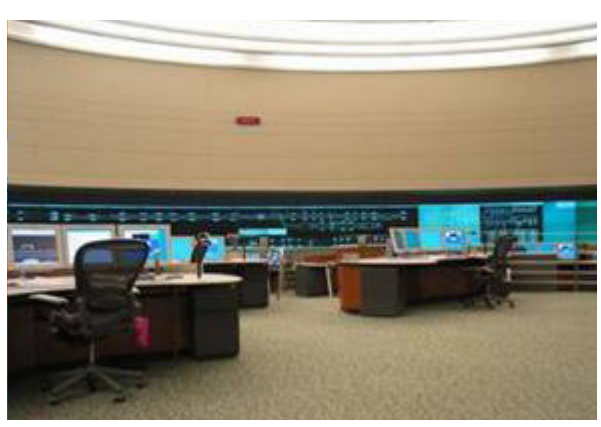
The New York City Transit rail control center will revolutionize control center operations.