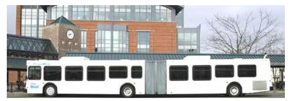
Articulated buses operate in downtown Eugene, OR.

Bus Solutions Prototype. Lightweight modular manufacturing methods can reduce the capital and maintenance costs of public transit vehicles while improving fuel economy and reducing emissions. Automation Alley and Altair Engineering ceased work on its traditional diesel engine and transmission powertrain to pursue a series diesel-hydraulic-hybrid powertrain concept.