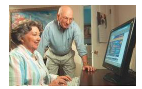
Senior citizens in Richmond, VA, plan their trip on GRTC Transit System's trip planner.

Traveler Information Systems. In 2009, the FTA deployed, demonstrated, and evaluated a multi-modal trip itinerary traveler information system called Goroo. The system provides side-by-side comparisons of trip itineraries using transit, driving, or a combination of non-motorized modes comprising biking and walking. It is the first web-based door-to-door multi-modal trip planner in the United States. Goroo was developed and demonstrated at Chicago's Regional Transportation Authority (RTA) to provide regional coverage of the six-county RTA region of Northeast Illinois.