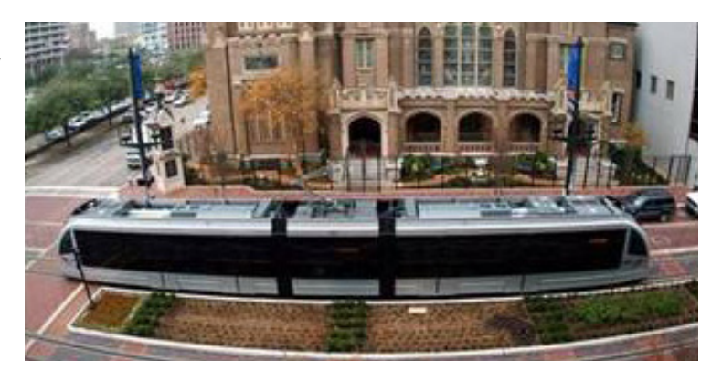
Houston METRO LRT provides convenient downtown service.

Providing Access to Public Transportation Stations. TCRP Web-Only Document 44, Literature Review for Providing Access to Public Transportation Stations, contains the results of a literature review of alternatives for station access for both new and mature high-capacity public transit systems, including heavy rail, light rail, commuter rail, and bus rapid transit. It is divided into six sections: (1) access issues and agency guidelines for transit access;