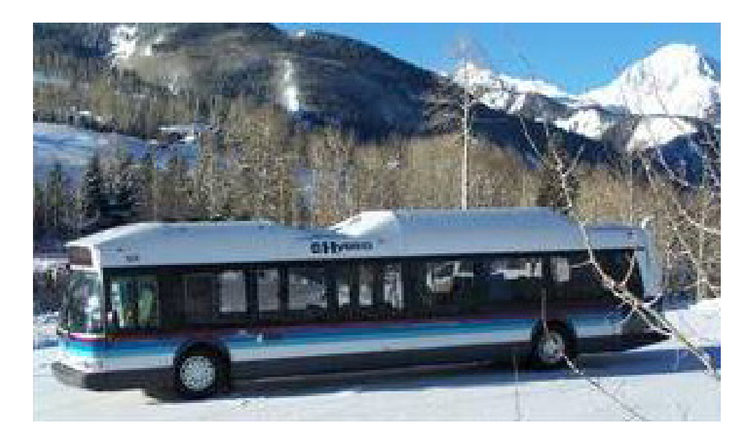
Roaring Fork Transportation Authority operates hybrid buses in the Rocky Mountains near Aspen, CO.

Delaware Fuel Cell Bus Program. The University of Delaware (UD) is designing, building, and demonstrating a fleet of fuel cell buses and creating a network of refueling stations in Delaware. In FY 2008, UD operated its first 22-foot public transit bus on a daily route on the UD campus and designed a second 22-foot public transit bus with a dual stack and advanced lightweight lithium titanate batteries. In 2009, EBus of California fabricated and delivered UD's second fuel cell bus, and UD began design of a 30-foot fuel cell public transit bus for delivery in 2010.