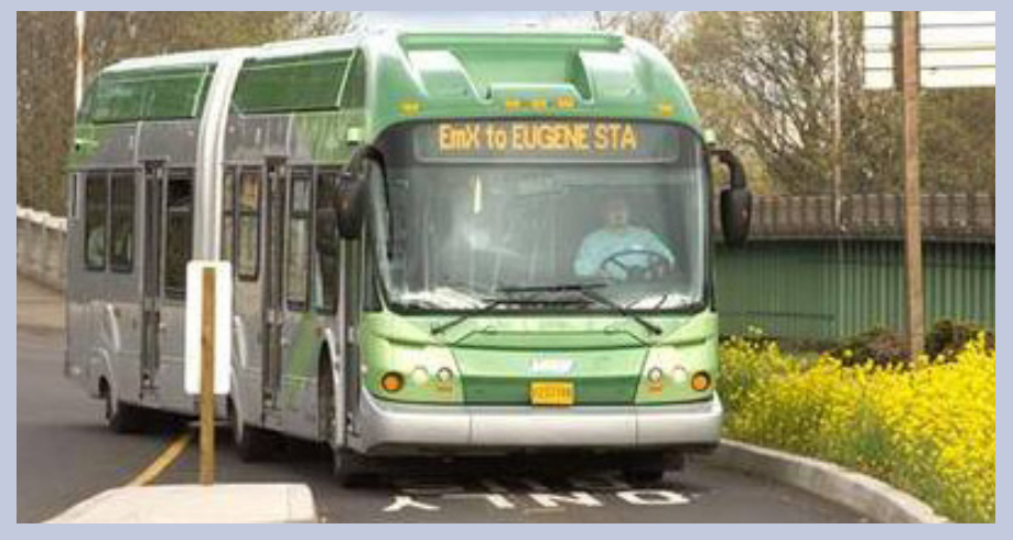
Eugene, OR, operates a bus rapid transit line with dedicated busways.

Following publication of Characteristics of Bus Rapid Transit for Decision-Making, NBRTI revised "Characteristics and Planning of Bus Rapid Transit" training to reflect new information from the report. The NTI conducts this training.