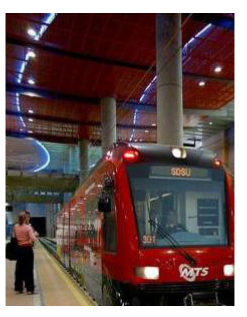
Left: Trax light rail trains pass in the Salt Lake City skyline sunset. Right: Metropolitan Transit System San Diego State University light rail train at the station.