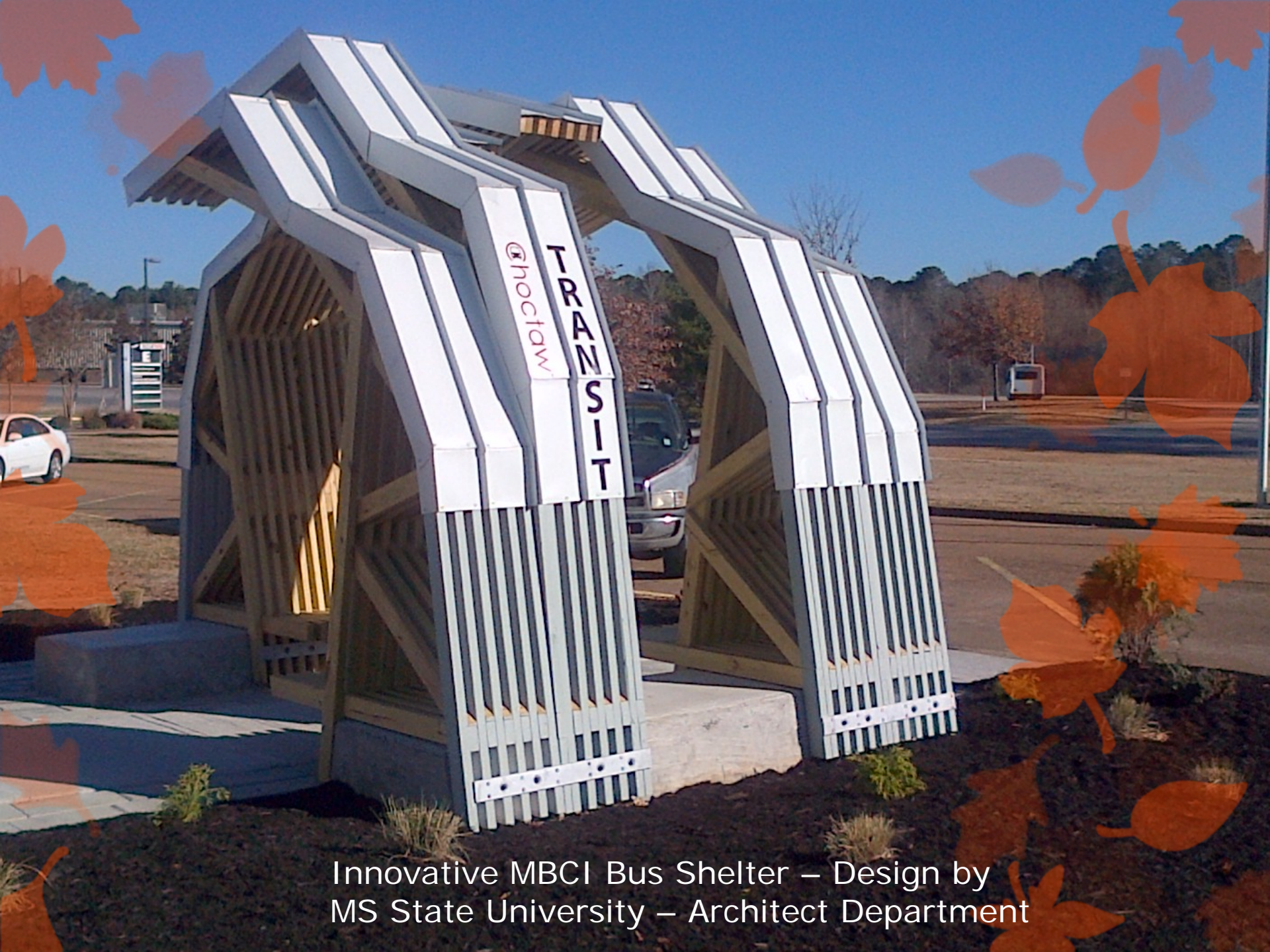
Innovative MBCI Bus Shelter – Design by MS State University – Architect Department