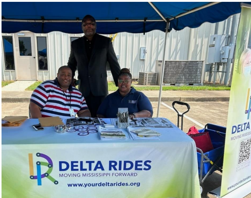
AEH staff, DELTA RIDES www.yourdeltarides.org