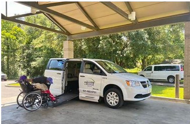
Pictured above: DJ Transit van driver picking up client for medical appointment.

Vehicles were not available for purchase due to low production during the pandemic. This was a restricting factor along with the rising price of gasoline. AEH and other transit providers used vehicles from the existing fleet.