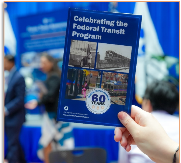
The printed program for FTA's 60 Years of Improving America Through Public Transit event held at the U.S. DOT Headquarters in Washington, D.C.

Together, we can make FTA better than ever, supporting programs that modernize transit, combat the climate crisis through low- and no-emission buses, improve access for people with disabilities, replace aging railcars, expand tribal transit, advance research and innovation, promote civil rights, and provide safety oversight.