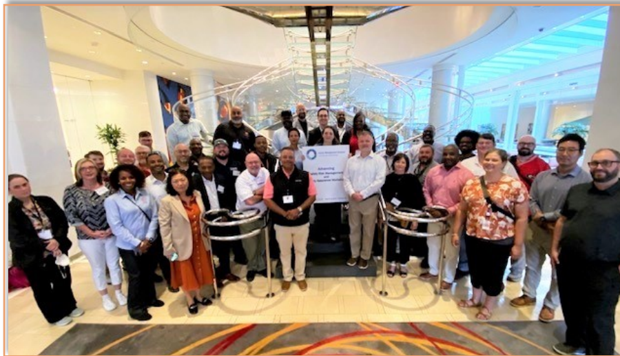
Several participants from the May 15—16, 2024, SMS in Practice: Advancing Safety Risk Management and Assurance Workshop in Atlanta, Georgia stands for a group photo following the workshop held at Hotel Indigo.