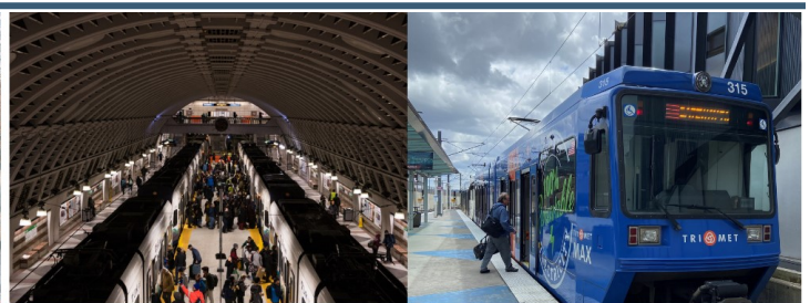
State Safety Oversight Notice of Proposed Rulemaking