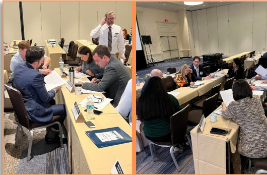
State Safety Oversight Agencies in-person attendees work together during the triennial safety audit case study breakout session.

This year, the first day of the workshop was for State Safety Oversight Agencies (SSOA) only and offered in-person sessions, including multiple panel discussions on the risk-based inspection program, an interactive Triennial Safety Audit case study and a session on FTA and SSOA enforcement. The day also included an optional office hours session focused on the risk-based inspection program which gave SSOAs an opportunity to meet with FTA's risk-based inspection team one-on-one for 15 minutes. The change to the workshop structure of an SSOA-only day was in response to feedback from the 2022 workshop. SSOAs capitalized on the in-person component of the workshop to ask questions about the risk-based inspection program.