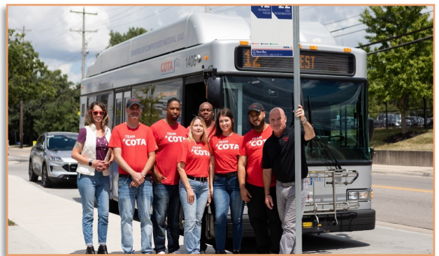
Central Ohio Transit Authority Risk Assessment Specialists

month training that includes learning how to administer Naloxone. The RAS team sees themselves as community connectors and capitalizes on their relationship with the Safe and Secure COTA for All Task Force. The current task force has 30 members including non-profit and social service organizations. As a smaller transit agency without transit police, COTA builds on its long-standing relationship with the Columbus police and hires off-duty officers to work with the RAS team to help build trusting relationships with the community.