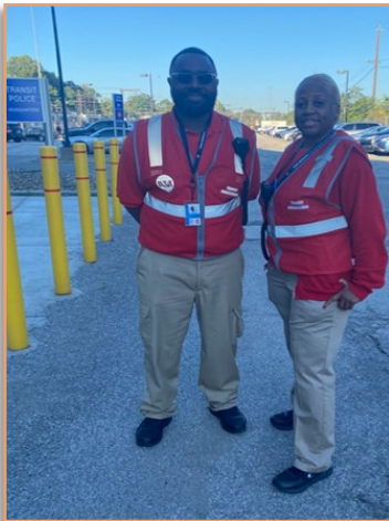
Members of Greater Cleveland Regional Transit Authority Ambassador Program

The GCRTA launched the Transit Ambassador Program in September 2022 and has since seen a noticeable increase in riders feeling safe while waiting for a bus or train or during their transit journey. The program includes both transit ambassadors and crisis intervention specialists who work alongside GCRTA's Transit Police to increase uniform presence while decreasing the police footprint. The transit ambassadors assist riders with navigation, develop relationships with operators and report any safety or security hazards. In addition, they are trained in CPR, first aid, and crisis intervention. GCRTA aims to continue building and maintaining community trust with the success of the Transit Ambassador program.