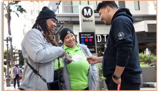
Members of LA Metro's Ambassador Program assisting members of the local community

LA Metro's Metro Ambassador Pilot Program fits into an existing public safety ecosystem including crisis response teams, law enforcement, metro transit security, contracted security and homeless outreach. As part of a layered public safety program, Metro Ambassadors ride railcars and buses and check stations. The Metro Ambassadors focus on customer care by helping riders with questions they have about using LA Metro and serving as high visibility agents to not only connect riders with resources, but also make sure they are comfortable on the transit system. Currently, there are over 300 Metro Ambassadors, and the pilot program will last three years with two one-year options to extend.