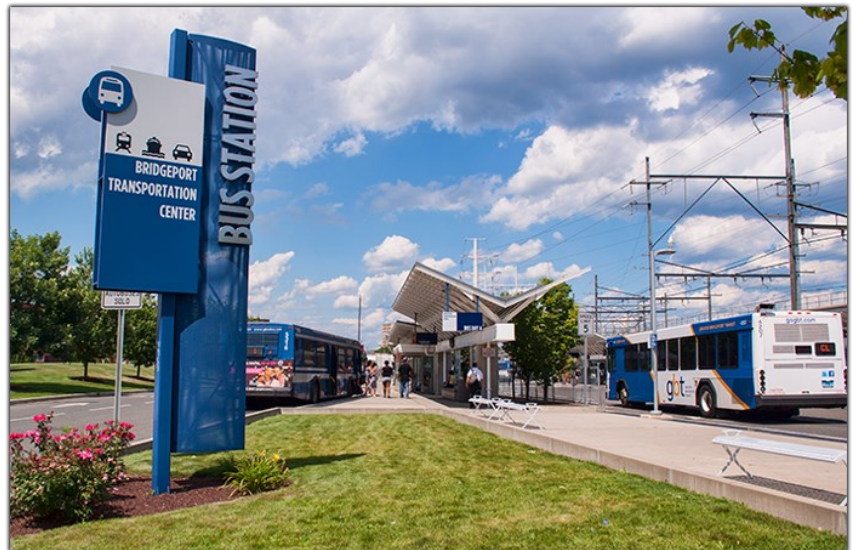
GBT multimodal transportation center

The basis of any effective TAM plan is high quality data collected and updated through an asset inventory. This issue of TAMNews provides an introduction to asset inventories, highlights Greater Bridgeport (CT) Transit's asset inventory development, and provides useful resources for agencies considering their own asset inventory practices.