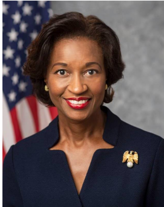
Nuria Fernandez FTA Acting Administrator