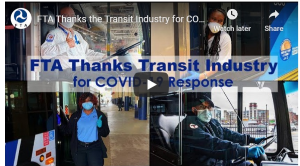
FTA's Thank-you message to public transportation workers.