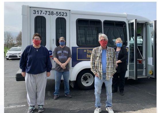
Access Johnson County Public Transit donated in-demand items to Johnson Memorial Health for use in its new emergency department.

Seattle, WA — Staff at Washington State Ferries (WSF) have implemented a creative, safer way for riders to pay fares during this emergency. In just 24