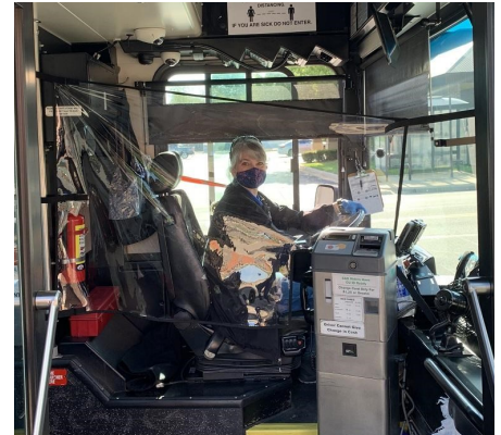
City Utilities of Springfield partnered with a local company to provide their bus operators with more protection.

Springfield, MO — To protect bus operators, City Utilities of Springfield partnered with a local upholstery company to fabricate and install clear plastic barriers on 27 buses over the course of a single week. City Utilities of Springfield received funding for this effort through FTA Urbanized Area Formula Funding, eligible under the Emergency Relief Program.